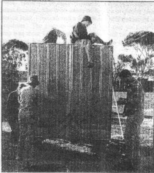
Before at left Preparing for Painting.

During the school holidays some keen saltbush members gave the 'o' van a facelift. The finished result is spectacular (resembling a giant control ! ) and will be visible for miles in the bush (we hope)